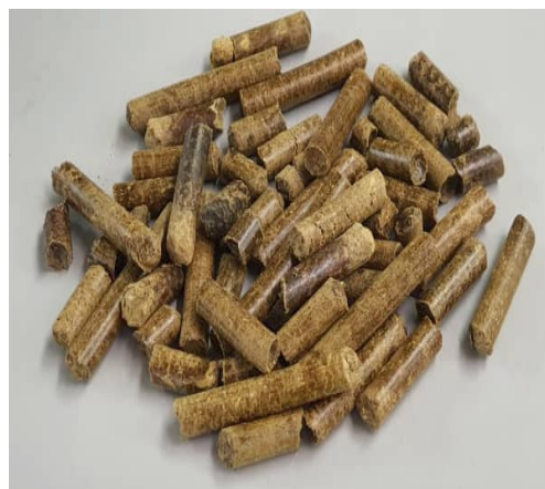
Figure 1 Pellet from Bamboo