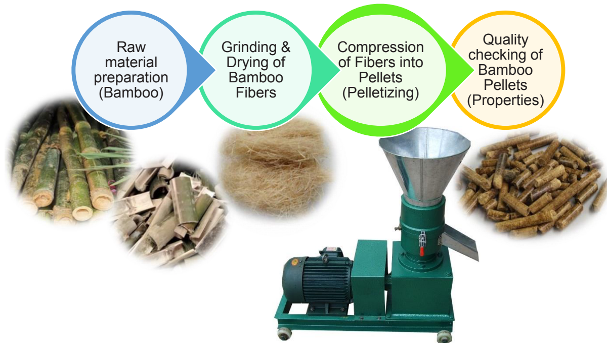
Figure 4 Bamboo Pellets Production Process

Pellets are produced through the compression of bamboo fibers using molds according to the desired size. The high compressive pressure will cause the pellet temperature to increase and the lignin content will act as a natural adhesive to bond the fibers together. The pellet diameter is approximately 6 mm with a length of up to 25 mm. The pellet machine used will automatically cut the pellet according to the desired length. The pellet production process is shown in Figure 4. According to Sudhagar et al. (2006), pellets are in cylindrical form and extremely dense with length size between 5 to 40 mm and diameter that ranges from 6 to 8 mm.