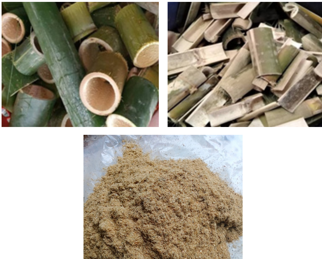
Figure 3 Green bamboo being processed into fibers

Green bamboo of 10 meters length is cut into short tubes which will later be split into sections. The sectioned bamboo will be ground into small size fibers. These bamboo fibers will be dried in the oven until the moisture content is between 12% to 15% (Figure 3). Dried bamboo fibers are ready to be pelletized to produce pellets.