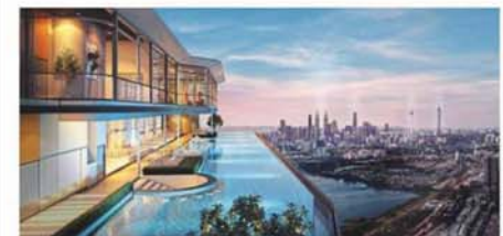
The exclusive infinity sky pool has magnificent views of the city skyline.

As prominent developers with a diverse property development portfolio, JL99 has projects ranging from high-end residential condominiums, mid-range serviced residents, affordable housing projects built for civil servants and housing redevelopment. The earlier 99 Residence received the Star Property 2020 awards for Excellence The Starter Home Award, The Family-Friendly Award and StarProperty Consumers' Choice Awards. For more information, visit www.99legend.com.my . Alternatively, visit www.jl99group.com.my for more on JL99's upcoming projects. 📍