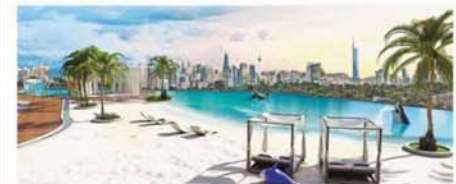
The iconic shark beach uniquely showcases two great white shark models and a beautiful white sandy beach.

N ESTLED in what is known as The Oasis suburb of KL North, 99 Legend is embracing Malaysia's status as a tropical paradise. The trailblazer high-rise is coming in strong by bringing the sun, sand and the beach right to its residents' doorsteps with Malaysia's first shark beach, featuring two great white shark sculptures on the facilities podium.