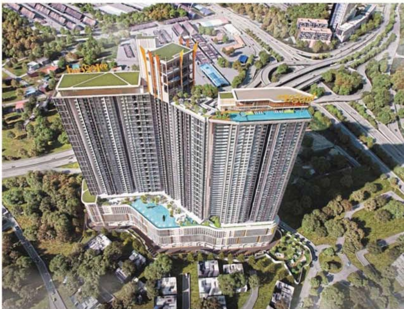
99 Legend's grand facade shows the serviced residence nestled amidst lush greenery.

Malaysia's first-ever shark beach within a serviced residence