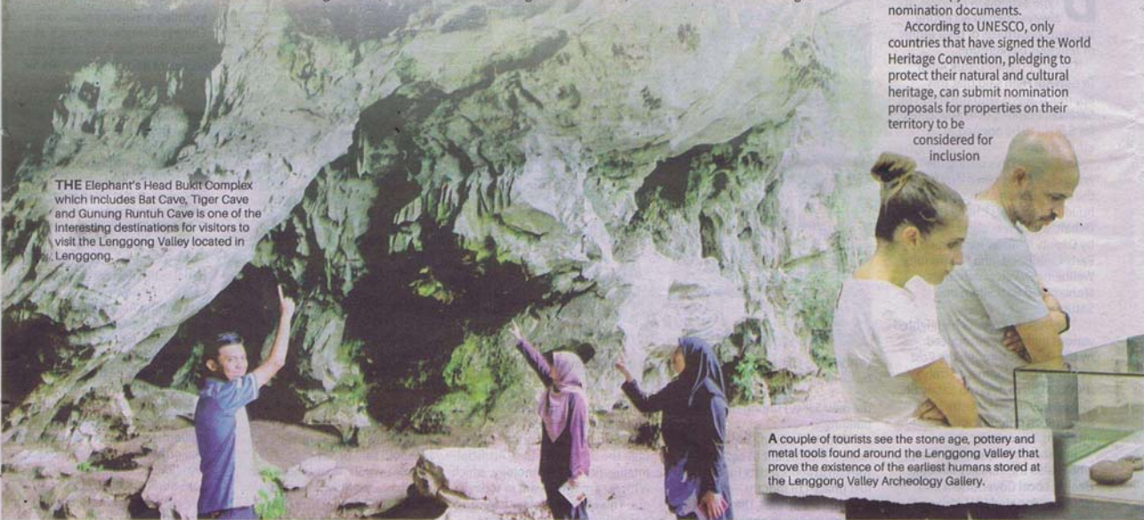
A couple of tourists see the stone age, pottery and metal tools found around the Lenggong Valley that prove the existence of the earliest humans stored at the Lenggong Valley Archeology Gallery.