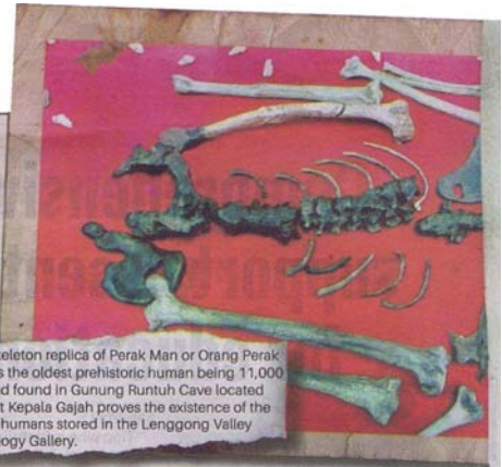
THE skeleton replica of Perak Man or Orang Perak which is the oldest prehistoric human being 11,000 years old found in Gunung Runtuh Cave located on Bukit Kepala Gajah proves the existence of the earliest humans stored in the Lenggong Valley Archeology Gallery.

According to UNESCO, only countries that have signed the World Heritage Convention, pledging to protect their natural and cultural heritage, can submit nomination proposals for properties on their territory to be considered for inclusion