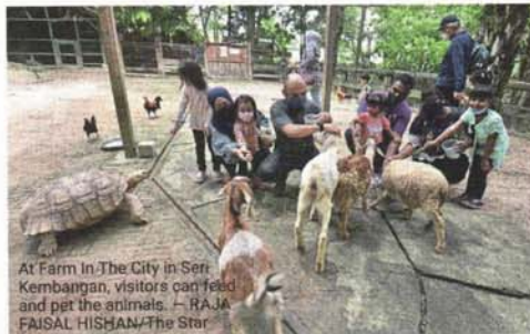
At Farm In The City in Seri Kembangan, visitors can feed and pet the animals.

Of course, one of the most popular spots around the Klang Valley for nature lovers is the Forest Research Institute Of Malaysia , or FRIM ( frim.gov.my ). This is where you go when you want to truly