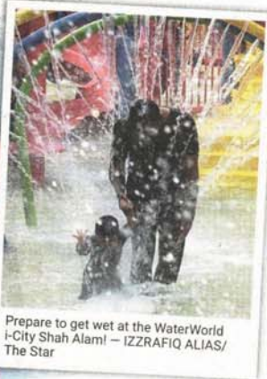
Prepare to get wet at the WaterWorld i-City Shah Alam!

Nearby, you can find the Kuala Selangor Nature Park , which has a diverse range of flora and wildlife.