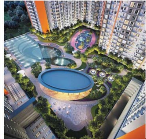
LEFT Launched in 2020 during the pandemic, M Luna achieved a take-up rate of 98%.