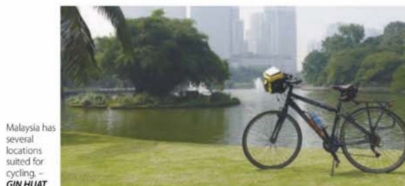
Malaysia has several locations suited for cycling.

While this neighbourhood is generally known for its lavish homes, Bukit Tunku is also a hotspot among local cyclists. Its geographical landscape indeed gives them the edge as it allows cyclists and urbanites to enjoy a good ride.