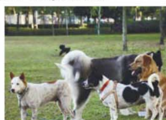
The Central Park is also a pet friendly park. – DESA PARK CITY