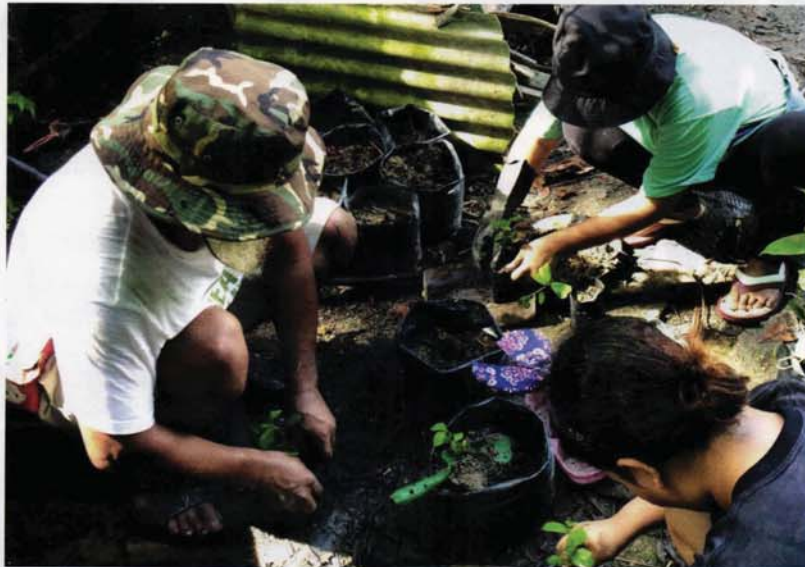
Preparing seedlings of native forest species through The Wild Tree Seed Bank programme at Kampung Bukit Kala Batu 16, Gombak