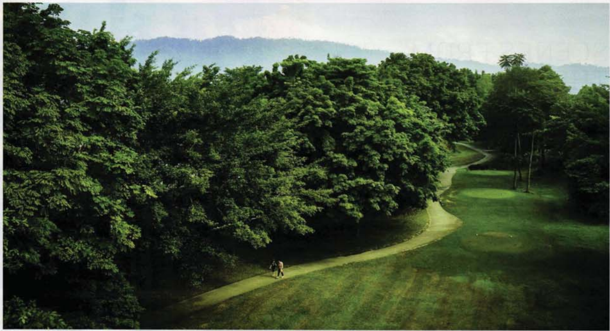
Result of the Miyawaki method in Valencia, Sungai Buloh