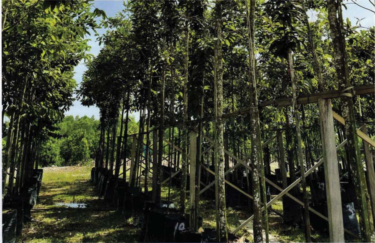
Intsia Palembanica and Shorea Roxburghii are among some of the species hosted at the Advanced Tree Planting (ATP) nursery in Gamuda Cove