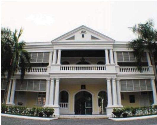
The imposing Sultan Suleiman Building is one of the prettiest colonial buildings in Klang.