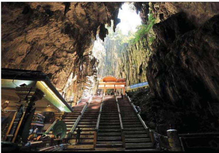
Batu Caves is home to a temple that's considered an important religious landmark by Hindus.

But if you venture further out, you'll find that Selangor has many surprises in store for everyone. With some recommendations from Tourism Selangor, we track down the things that visitors can do at six of the districts in the state.