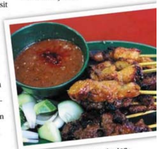
Satay Kajang is known to be tender and flavourful.

Those looking to scale Mount Kinabalu in Sabah can make the district's Mount Nuang (1,483m) their training ground. More amateur hikers can head to Saga or Broga hills for a more beginner-friendly hike.