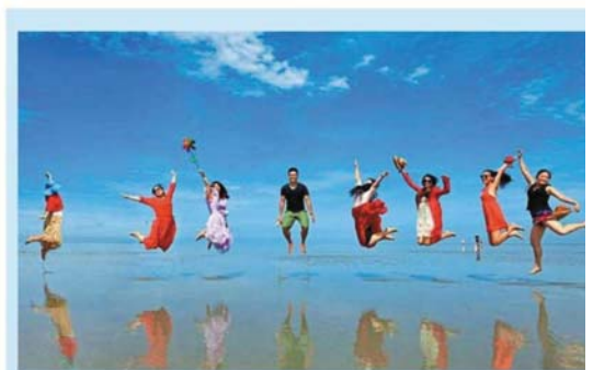
Sky Mirror in Kuala Selangor is one of the top attractions to visit in Malaysia.