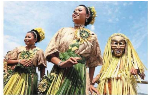
Pulau Carey, home to the legendary Mah Meri tribe.

Historical buffs can visit Istana Bandar in the former royal town of