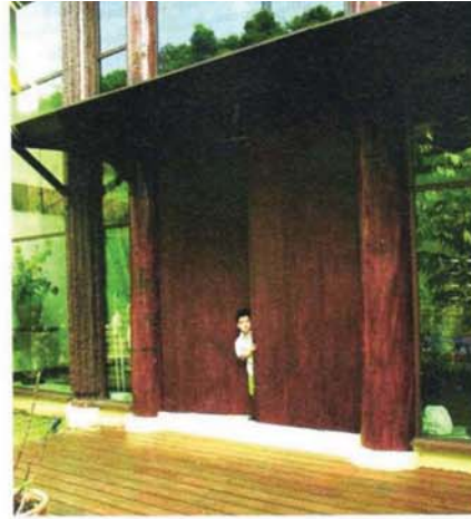
The warmth and beauty of Malaysian wood is appreciated the world over

DOORS DESIGNED-TO-ORDER: Made-in-Malaysia timber doors come in a wide range of designs and materials. Take your pick from traditional solid timber doors, a part of human life and dwellings since ancient times, or more modern-engineered versions, which may also be overlaid with popular foreign woods such as Oak, Walnut,