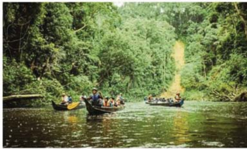
The beauty of Taman Negara in Pahang is off limits to visitors for now.

"Kuala Lumpur Forest Eco Park sees an average of 500 visitors on weekdays and between 1,000 and 1,500 daily on weekends. Due to the large number of visitors, we have decided to take pre-emptive measures and close the park to