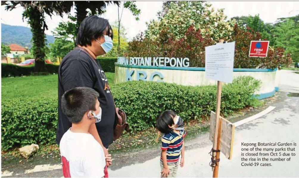
Kepong Botanical Garden is one of the many parks that is closed from Oct 5 due to the rise in the number of Covid-19 cases.

By VIJENTHI NAIR vijenthi@thestar.com.my