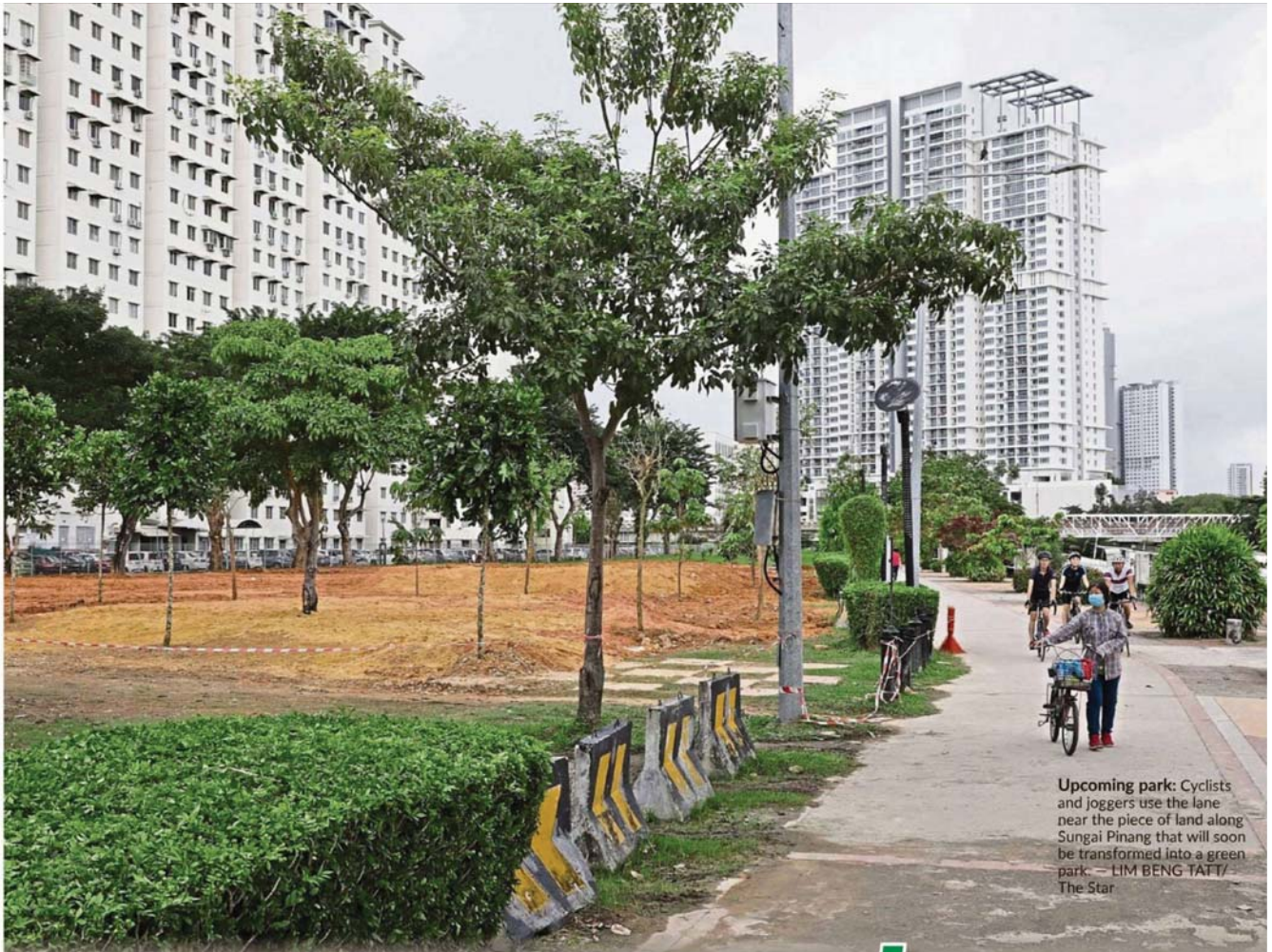
Upcoming park: Cyclists and joggers use the lane near the piece of land along Sungai Pinang that will soon be transformed into a green park.