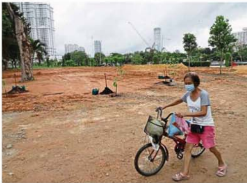
A cyclist passing by the empty plot of land in Lebuah Sungai Pinang 7 that will be converted into a green neighbourhood park.