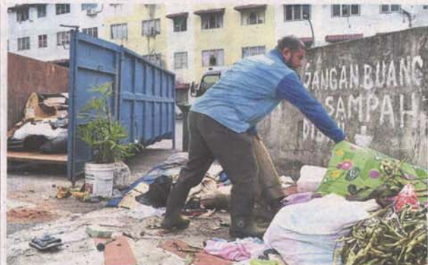
(Above) MBSA is handing over its cleaning and rubbish collection services to KDEB.

Municipal Council (MPSepang) has been and will continue to promote its products and attractions.