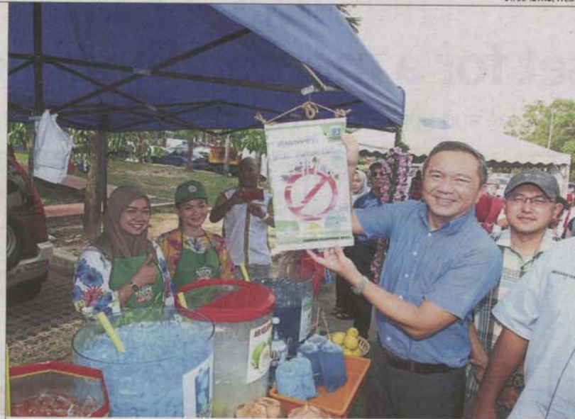
Ng, seen here launching a straw-free campaign in Bandar Kinrara, says the government will continue its efforts to make Selangor a low-carbon city.