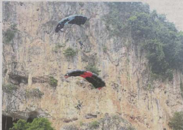
The Gua Damai International Base Jump will be held in Batu Caves, Gombak, in September.

Selangor local councils to focus on improving residents' quality of life