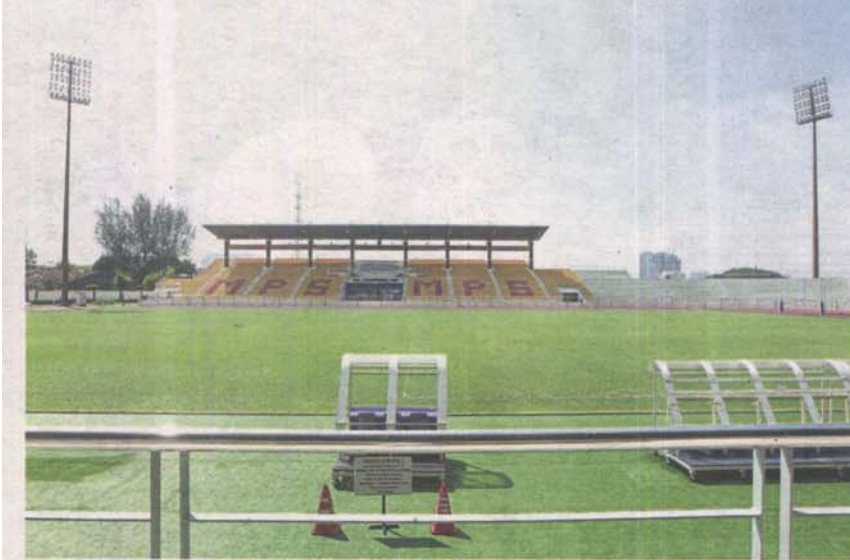
Selayang Municipal Council's football stadium will reopen on Jan 15 following turf upgrades and repairs.