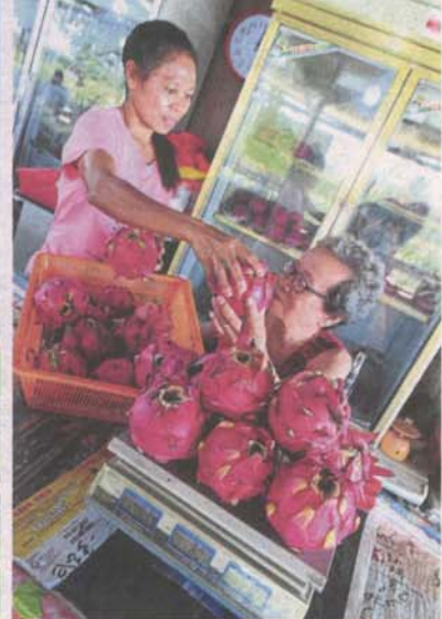
A Dragon Fruit Festival will be held on June 20 in Sepang to promote the local fruit.