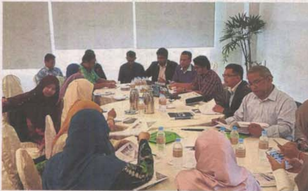
MPKJ will be engaging with residents on its low-carbon initiatives.