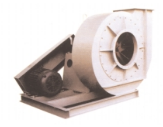
Figure 1. Radial centrifugal fan

For a dust extraction system in woodworking plants, the most commonly used fan is the radial centrifugal fan. In this type, the impeller may have a conventional backplate and shroud or may be of the paddle-bladed type with flat blades attached directly to a spider hub. This latter type is particularly suitable for handling sawdust or wood refuse in the extraction system (Figure 1).