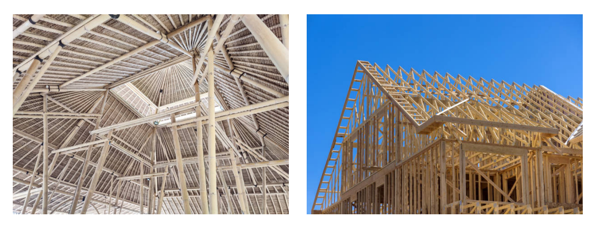
Figure 1 Wooden and bamboo building structures

The two main categories of wood/bamboo defects are due to biological and non-biological deterioration. Biological deterioration is caused by fungi, termites, wood borers and marine borers (Reinprecht 2016). All of these pest agents in poor condition (exposure to fluctuating relative humidity levels), can easily damage wood even if preventive measures have been taken. Non-biological deterioration on the other hand is caused by environmental exposure which includes physical decay, excessive moisture content, dimensional instability and chemical deterioration. These deteriorations usually resulted to the loss of large amounts of raw materials or the destruction of finished wood and bamboo products. Large quantities of wood and bamboo are destroyed each year by insect borers, although the extent of the loss has yet to be assessed (CABI 2019). Infestation in storage yards starts with improperly dried, untreated wood and bamboo, and stockpiling with susceptible wood and immature bamboo stems.