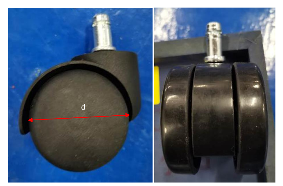
Figure 2 50-mm (left) and 60-mm (right) diameter (d) wheels made of nylon plastics