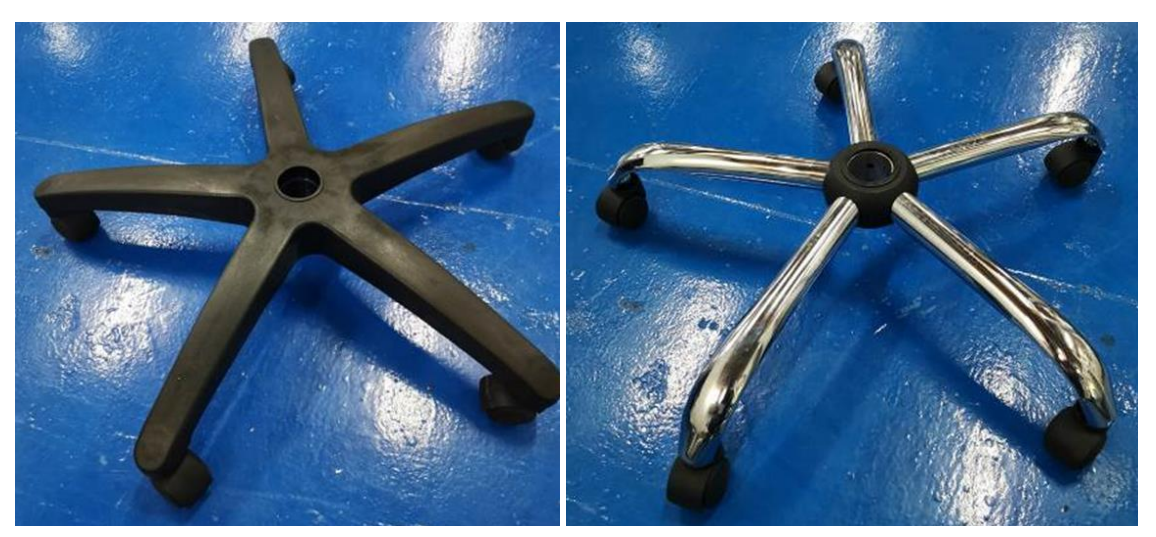
Figure 3 Plastic prong (left) and metallic prong (right)