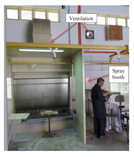
Figure 2 Ventilation and spray booth

The spraying process should be conducted in a spray booth where ventilation is available (Figure 2). This is important in order to prevent the concentration of flammable materials build-up in a restricted area. Figure 3 shows the correct personal protective equipment that an operator should be wearing during the coating operation.