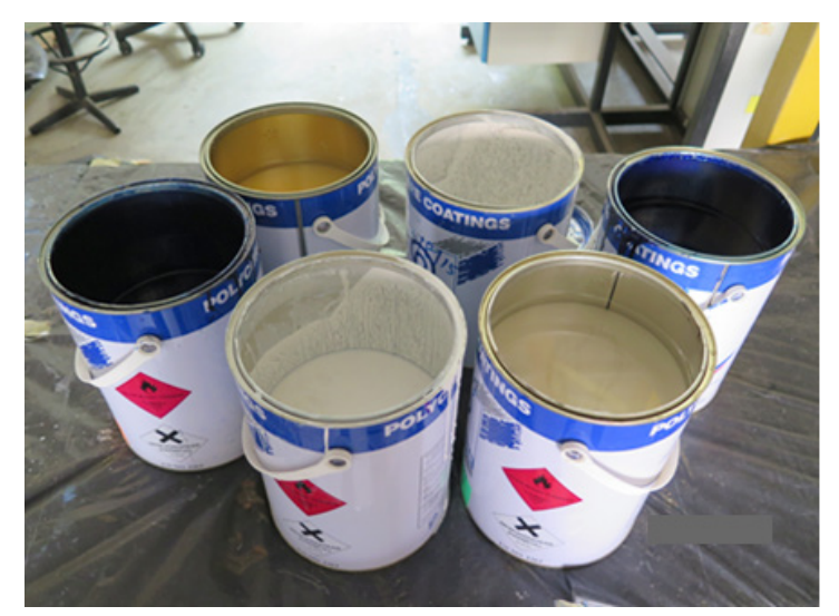
Figure 1 Examples of solvent-based coatings available in the market